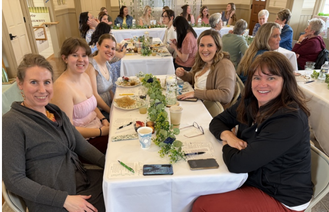
Left: Bridal shower