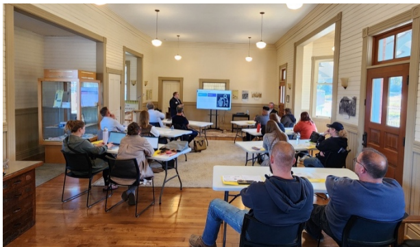
Left: Business Financial Management Seminar