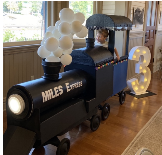
Right: Birthday party